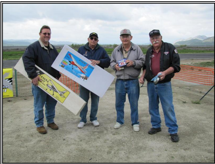
Happy Raffle Prize Winners