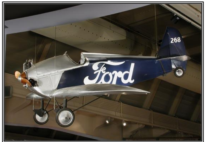
Full Scale Flivver hanging in Henry Ford Museum