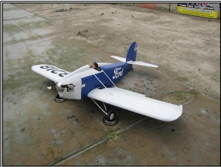
Another view of Holly's Ford Flivver