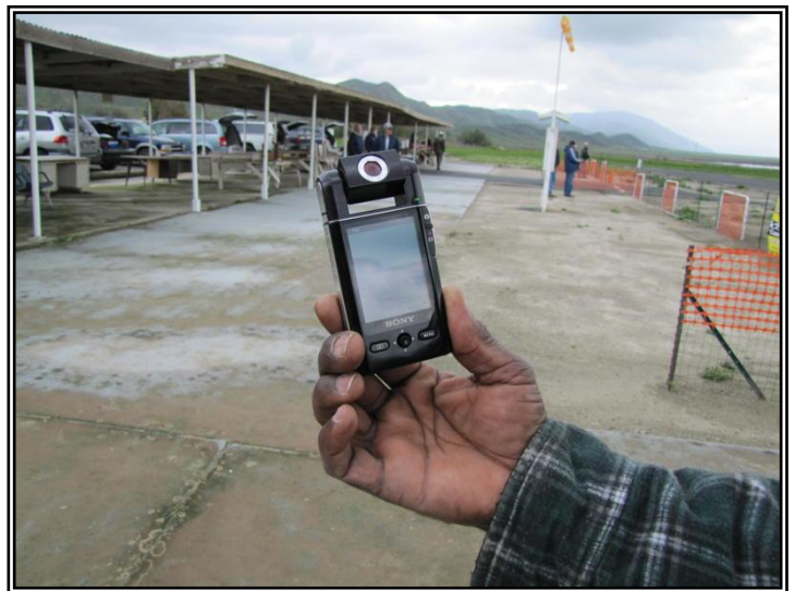
Close-up of Roy's Camera