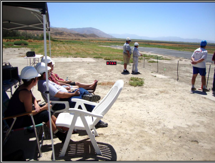
Lap Counter “Pickle” Button Operators (Lap Count Display in the background)