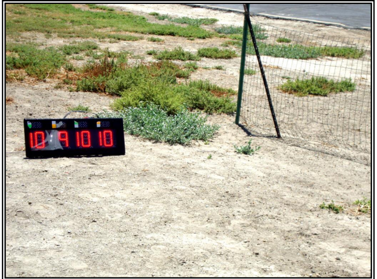
Close-up of the Lap Count Display Left to Right: Low Green, Low Orange, High Green, High Orange.