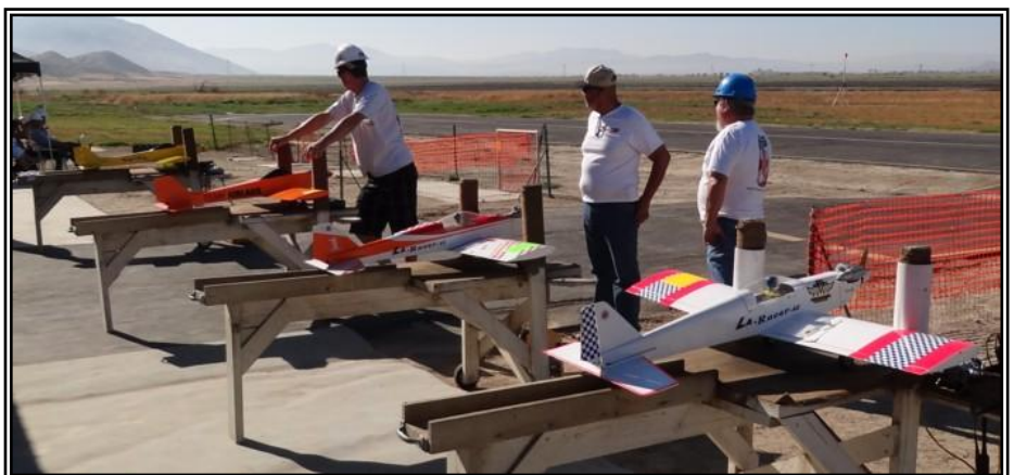
Four Racers at the Start Line, ready for "Pilots, Start Your Engines".