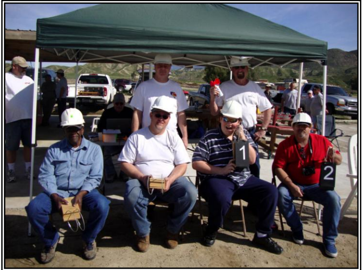
The Race Officials