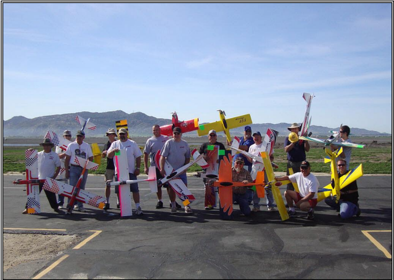
THE FIFTEEN CLUB 40 PYLON RACE PILOTS, RARING TO GO!