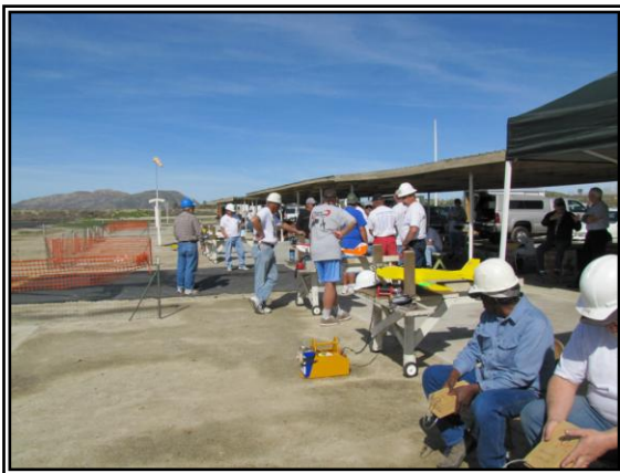
Engine Start-up Area