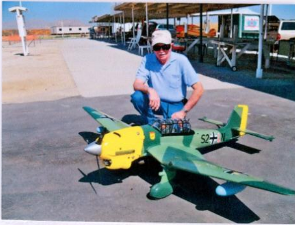
Mel Santmyers, BH Models Stuka ARF, 1.25 Saito 4-S engine