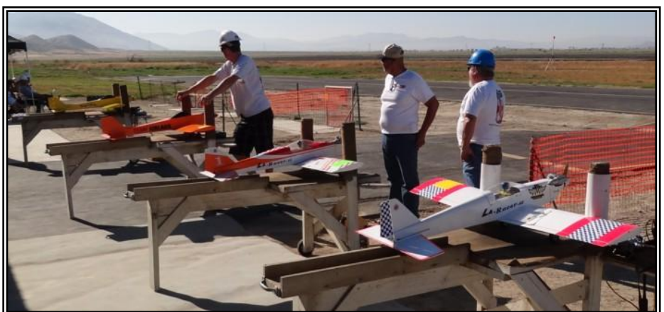
Four Racers at the Start Line, ready for "Pilots, Start Your Engines".